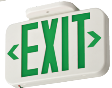
EXG LED EL