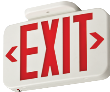
EXR LED EL