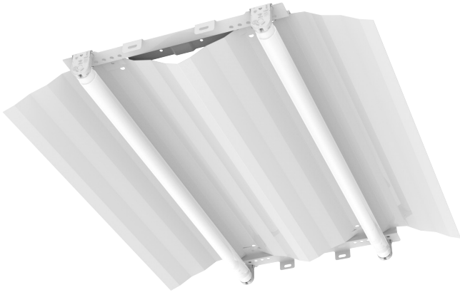
2x2 2 Lamp